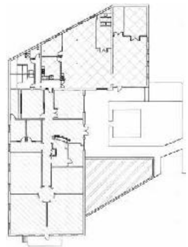
ground level floor plan