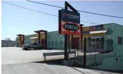
ABOVE: Marietta Street elevation